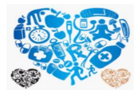
Family Agency Collaborative/ Colorado Cultural Consortium